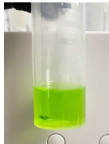
OREAS 353 after 20-min Inverse Aqua Regia digestion